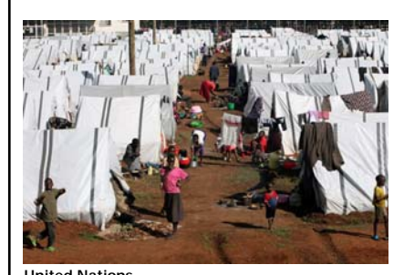
Office for the Coordination of Humanitarian Affairs